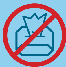
Wipes (Baby or flushable)