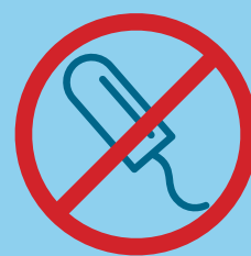
Feminine hygiene products