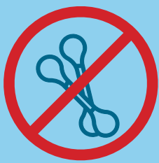
Cotton (Cotton swabs or balls)